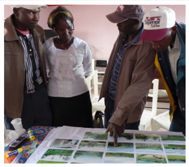
Farmers from different areas comparing practices

Multi-stakeholder processes (MSPs) can be designed in several steps to enable many different people to meaningfully contribute. Although multi-stakeholder platforms typically are composed top-down with an emphasis on government, industry and large organizations, the concept can be applied to create bottom-up MSPs.