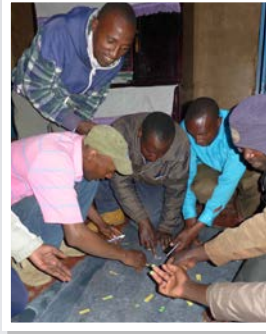
Milk traders preparing for dialogue

For example, the bottom-up multi-stakeholder processes that involved small-scale dairy value chain actors in Nakuru (Kenya), yielded