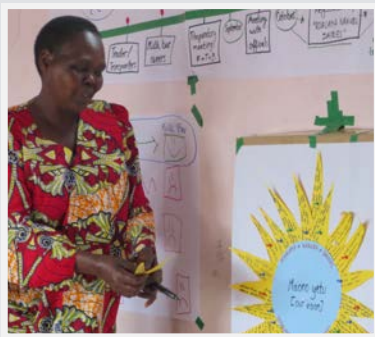
A milk bar owner contributes to setting multi-stakeholder goals

Transdisciplinary research builds a close collaboration with societal stakeholders in order to find solutions to complex real world problems, for example in food and farming systems.